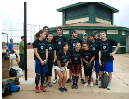
ACCOUNTING SOCIETY CHILI COOK-OFF 2010 – UTA AND TSCPA ARE ALWAYS A WINNING COMBINATION. (PICTURE AT LEFT)

Congratulations to all of you for your dedication and hard work!